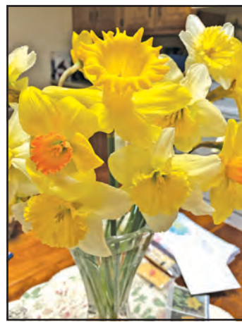
A profusion of daffodils blooms in Linda Dalgety's yard in Port Haywood.