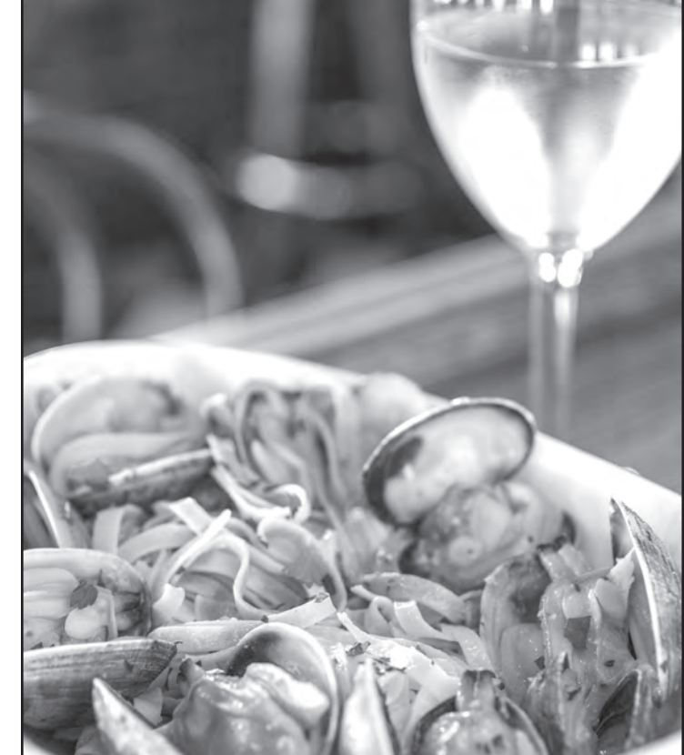
Some basic pairing knowledge might be all that's truly necessary to make a meal more memorable.

Pairing wines may seem intimidating. But a few simple strategies can help novices find a wine that makes a homemade meal that much more delicious.