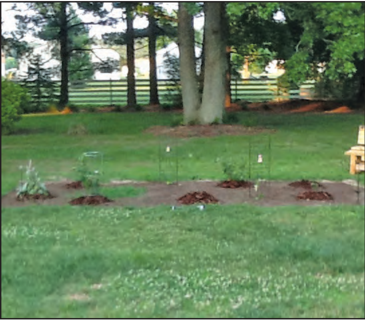
The beginning of West's garden.

Vanessa West of Hayes began building her backyard butterfly garden five years ago. Her friend, Kaleela Thompson, encouraged her to build the garden to be a sanctuary for butterflies and to help preserve the monarch butterfly. West has planted pink, yellow and white milkweed for monarch butterflies, parsley for black swallowtails and pawpaw trees for her favorite butterfly, the zebra swallowtail. She grows these specific plants in her garden because they are the respective butterflies' host plants. A butterfly's host plant is the only plant where it will lay its eggs.