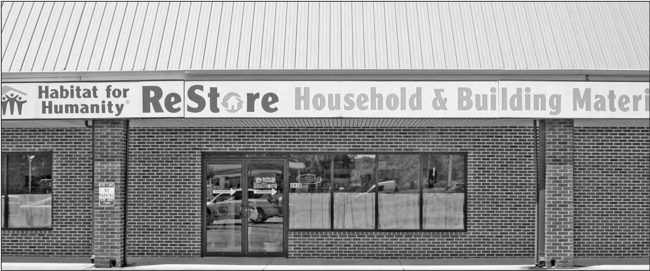
Gloucester-Mathews Habitat for Humanity raises much of its funding from the ReStore located in White Marsh Shopping Center. Its doors had to close in the early weeks of COVID-19 and the organization said it is badly in need of support