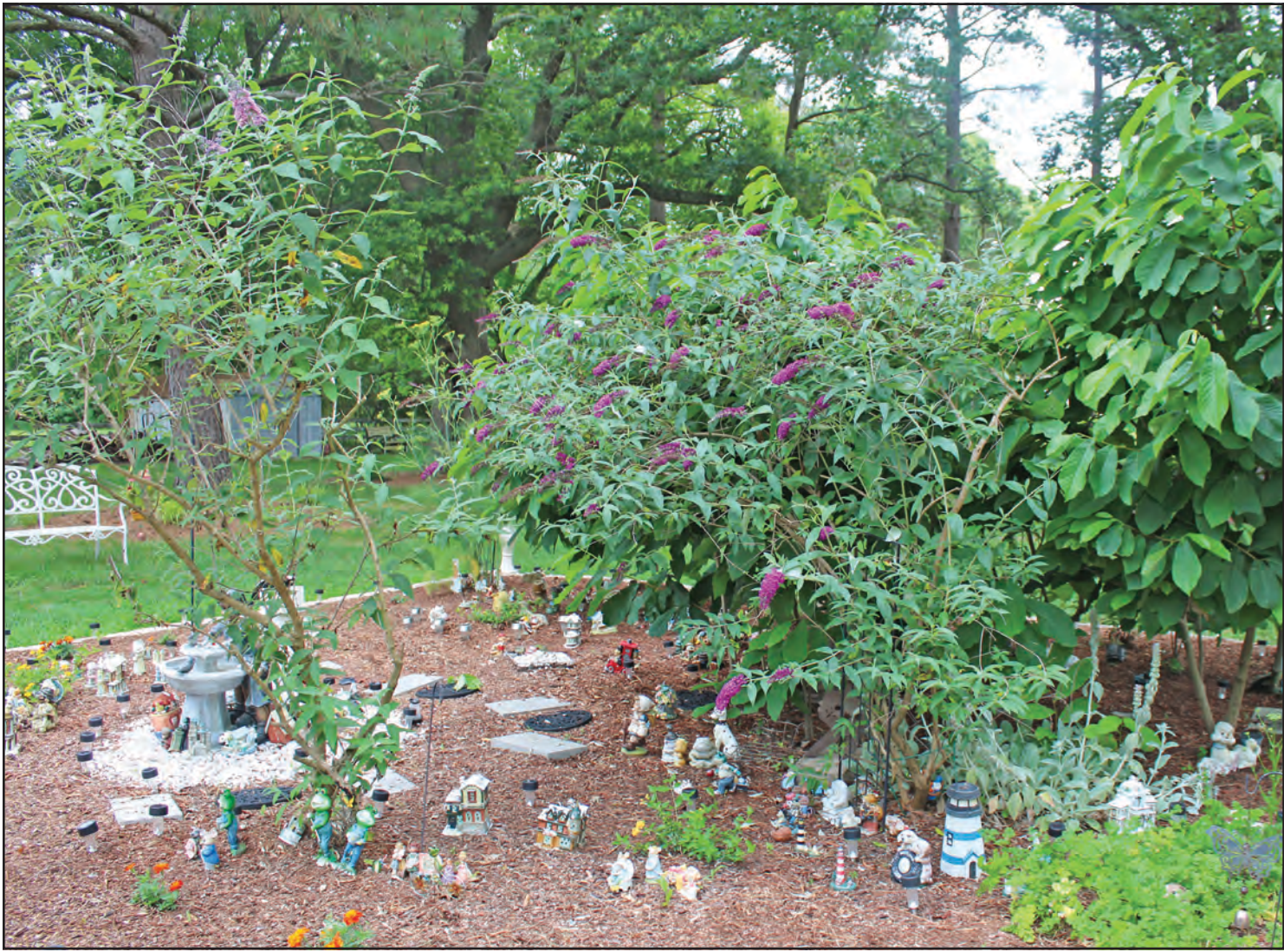
Vanessa West began building her butterfly garden in 2015 with a friend's encouragement. She calls it a sanctuary for butterflies.