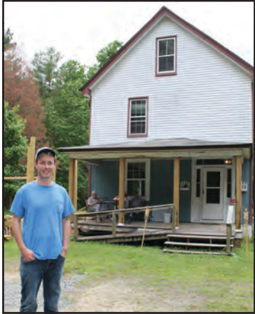
Bringing an old house in Mathews up to modern standards...C6.