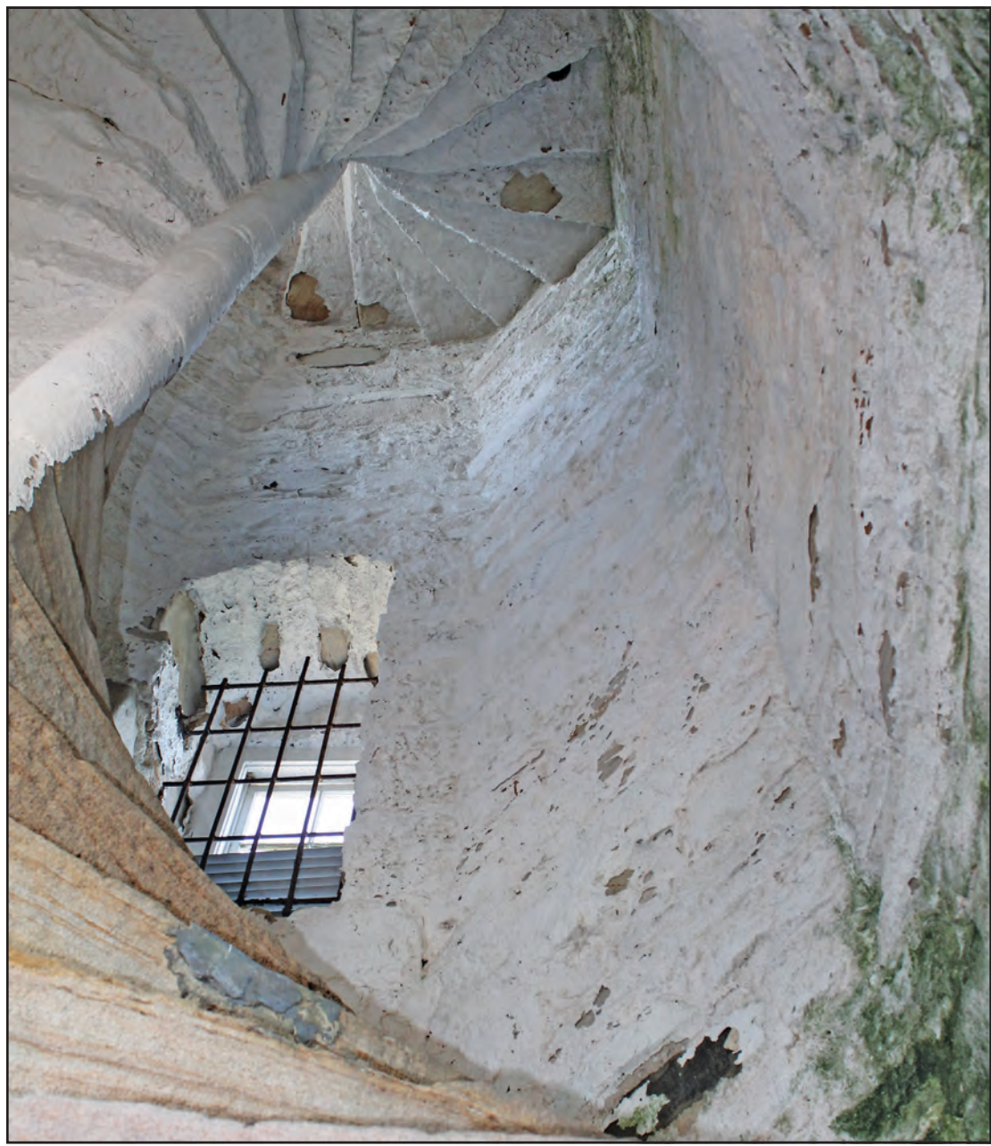
A spiral stone staircase leads to the top of the New Point Lighthouse tower.