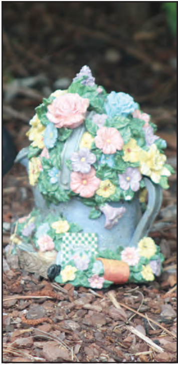
A music box disguised as a watering can rests in the butterfly garden.