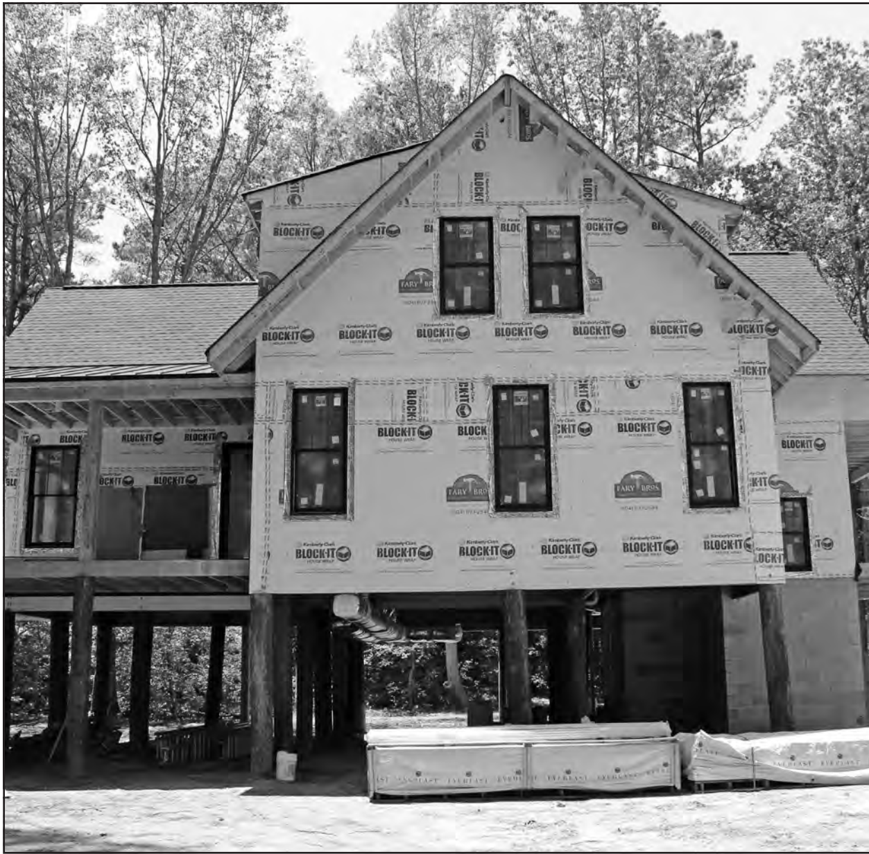
Bridges Contracting is currently working on a custom home on Baileys Wharf Road in Gloucester. The house is located in a flood zone which required 35’ tall pilings to raise the house.