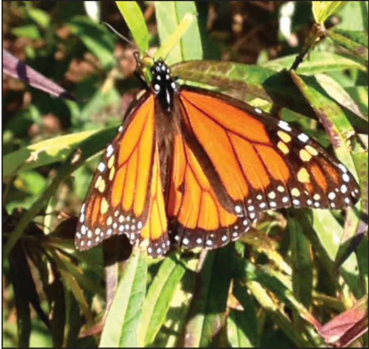
A monarch butterfly has landed in West's garden.