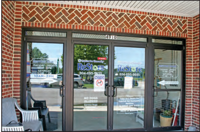
A call for help from the community...page 4C.