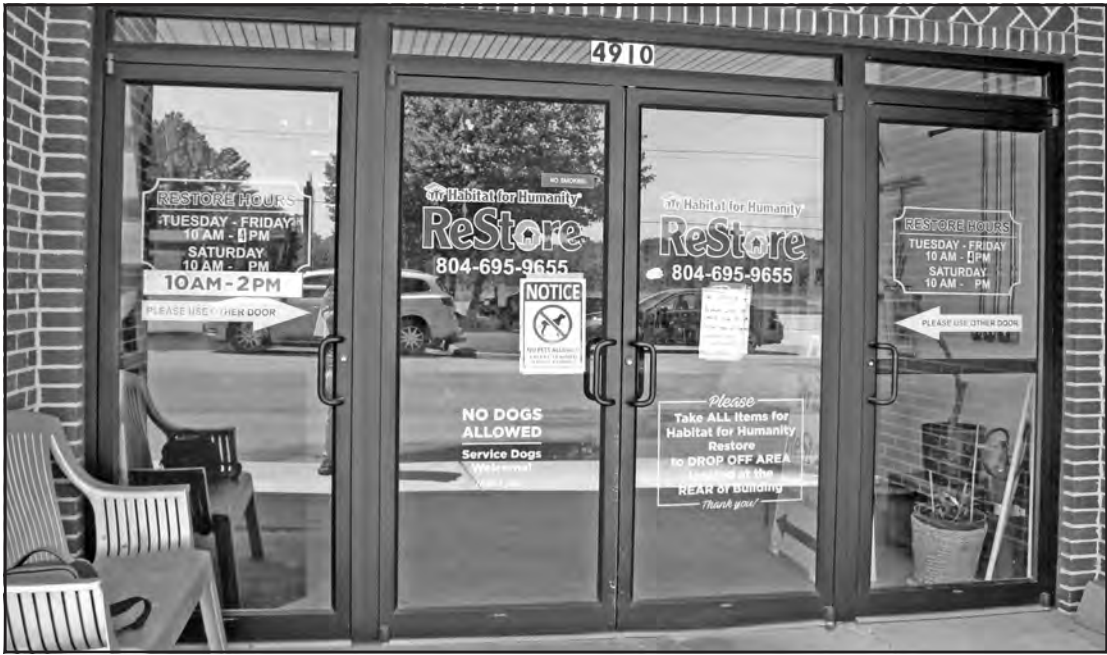
ReStore is open Tuesday through Saturday.