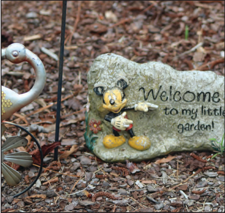
One of West's trinkets features an image of Mickey Mouse and reads "Welcome to my little garden."