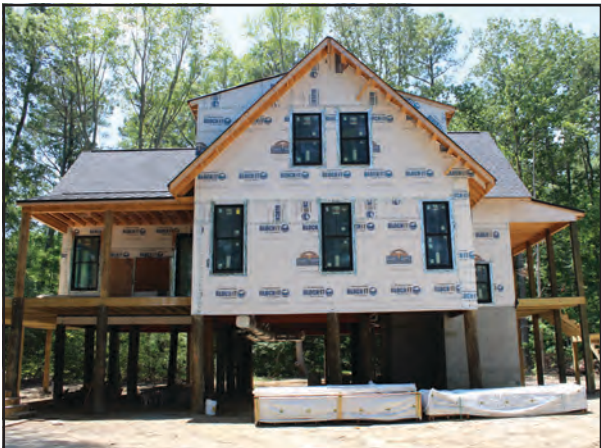
Custom homebuilder has his son by his side...page 5C.